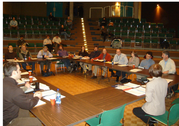
Participants at the ACZISC Meeting, January 2009 at the Bedford Institute of Oceanography in Dartmouth

The meetings were held in St. John's, NL on 14-15 May 2008; in Fredericton, NB on 24-25 September 2008; and in Dartmouth, NS on 22-23 January 2009. The meetings are supported via in-kind contributions from ACZISC members.